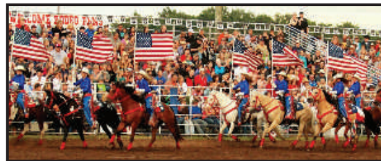
Rodeo City Riders Drill Team

Specialty Act TBA at www.manawarodeo.org