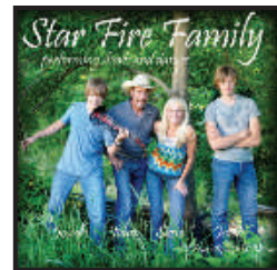
Star Fire Family Show Friday Night Dance