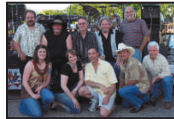
Buffalo Stomp Thursday Night Dance