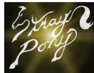
Stray Pony Saturday Night Dance